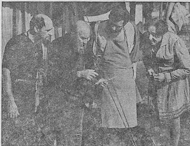
Scripture portions secretly passed from hand to hand during the Dark Ages